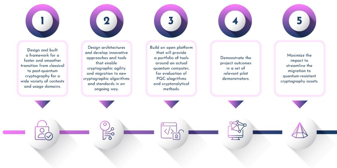
Figure 1: OBJECTIVES OF THE PQ-REACT PROJECT